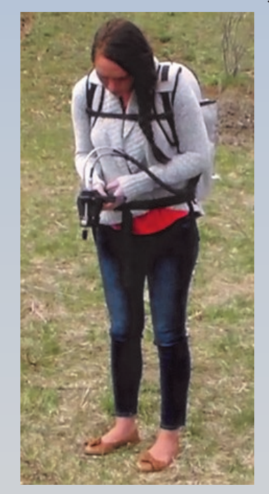
The RS-8800 goes in a backpack and can be equipped with a unique, custom pistol grip to take all the measurements required for field work.

The RS-8800 with the Sensaprobe <sup>TM</sup> grip allows for consistent measurements by any user at any experience level to ensure that measurements are taken correctly in the field for research applications. See exactly what you are scanning with the embedded camera. It can also be used for vicarious calibration to validate satellite or flyover hyperspectral and multispectral data being used in research.